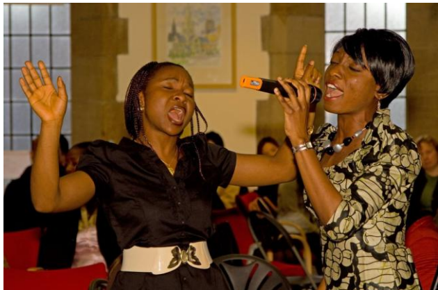
Two of the choir singing at the International Student Club's 25 th Birthday Party

A warm thank you for all of you who have been praying and supporting the international students and staff work in Leeds Universities Chaplaincy. It has been great to see the work stabilise on a new level which has released energy and time for meeting with more students. Some of them have had good positive changes in their lives which makes everything so worthwhile. Let's pray for a deepening discipleship for those who have got to know the Lord Jesus while in Leeds and opportunities to reach out for those who are interested of God's Good news.