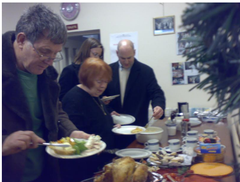
Trinity Christmas Lunch