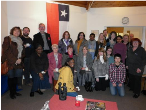
Visit to the Chaplaincy by the Mayor of Leicester

Two Fund-raising Dinners (Chaplains cooked) attendance of 50-60