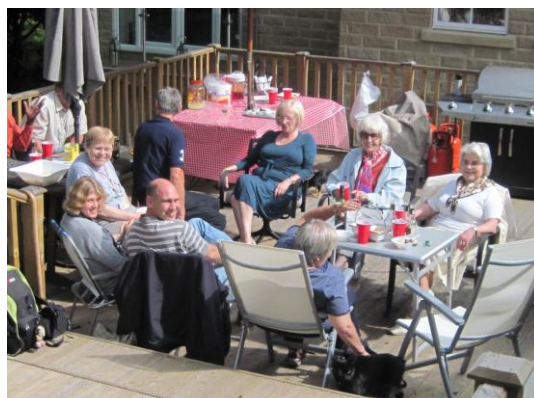
Enjoying the sunshine in Ron's garden