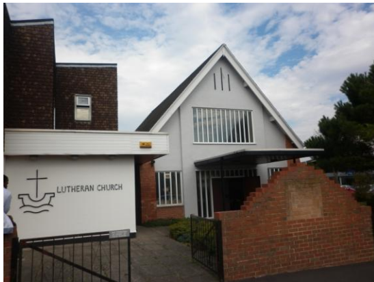
Our Lutheran Church In Nottingham

We are looking forward to celebrating “50 Years of Trinity” this June