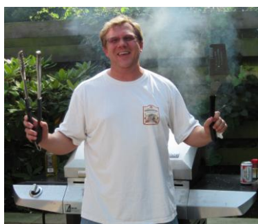
...while he did all the work!