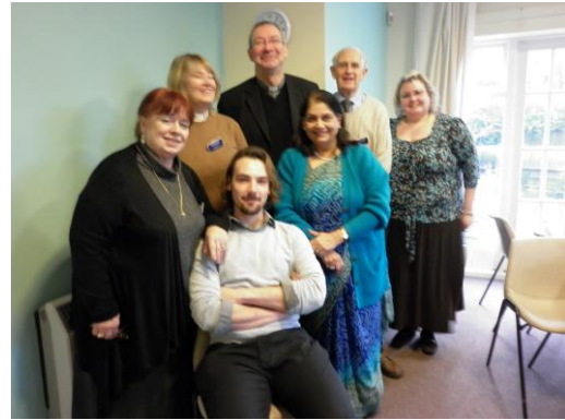
Service for the Womens' World Day of Prayer