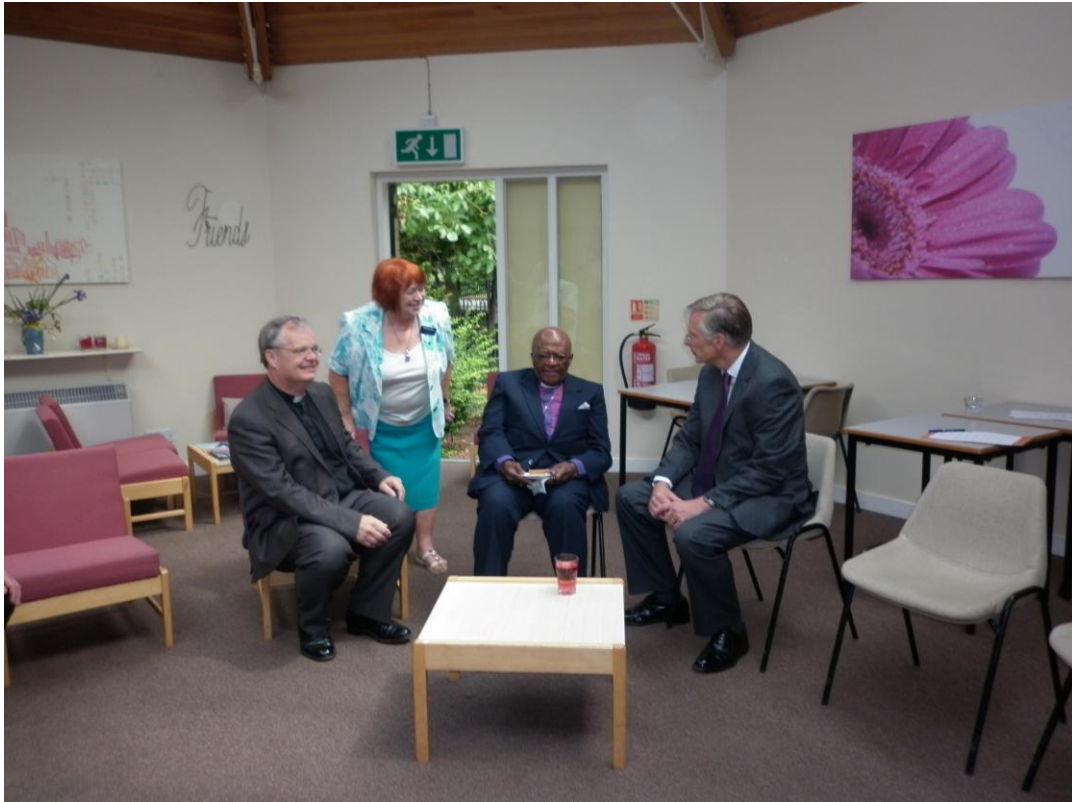
Visit to the Chaplaincy by Archbishop Desmond Tutu