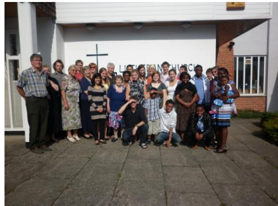
Welcoming some visiting American students